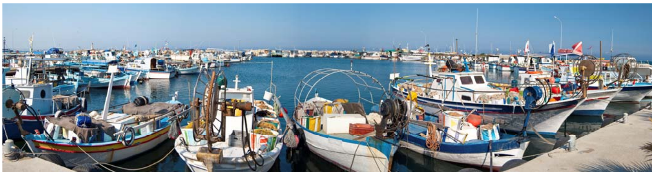
Fishing Boats in Paphos Harbour