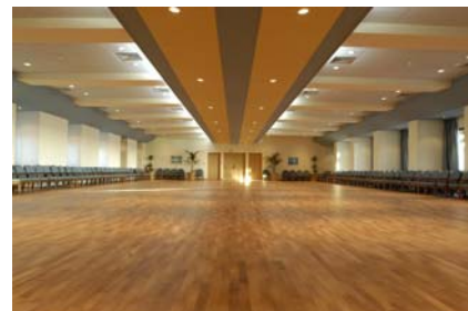
The 450m 2 wooden dance floor