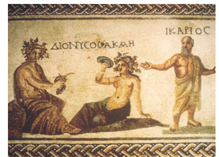
An Ancient Paphian Mosaic