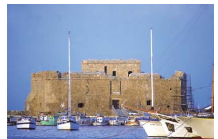
Paphos Harbour Fort